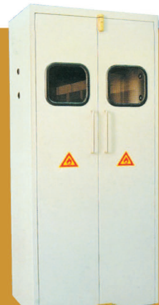
All steel gas cylinder cabinet