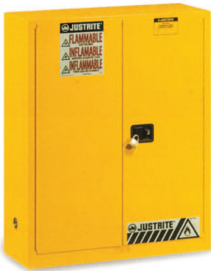
Yellow-flammable liquid fire safety cabinet