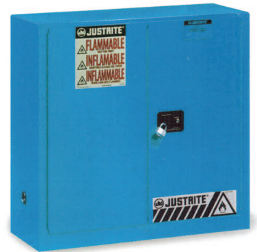
Blue-acid proof safety cabinet