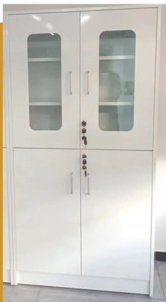
All steel reagent cabinet