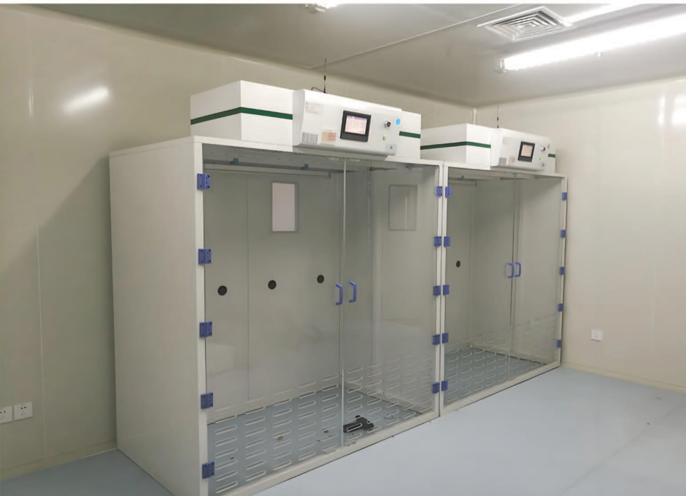
Floor-Standing Fume Hood

Activated carbon molecular filtration, SDG molecular filtration