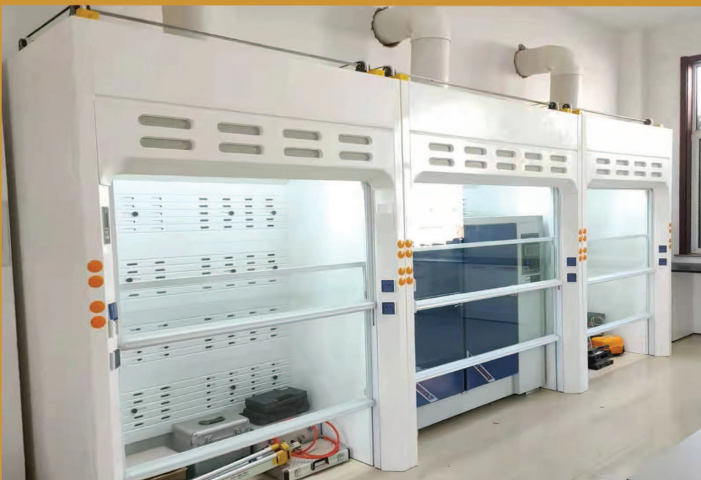
Four-Standing Fume Hood

Flame retardant fume hoods can be tailored to laboratory dimensions