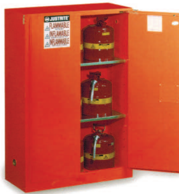
Red-combustible liquid fire safety cabinet