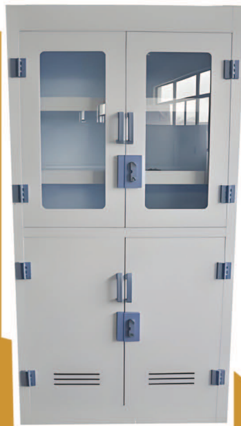
PP reagent cabinet